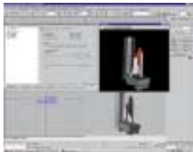
Cult3D Exporter for 3D Studio MAX